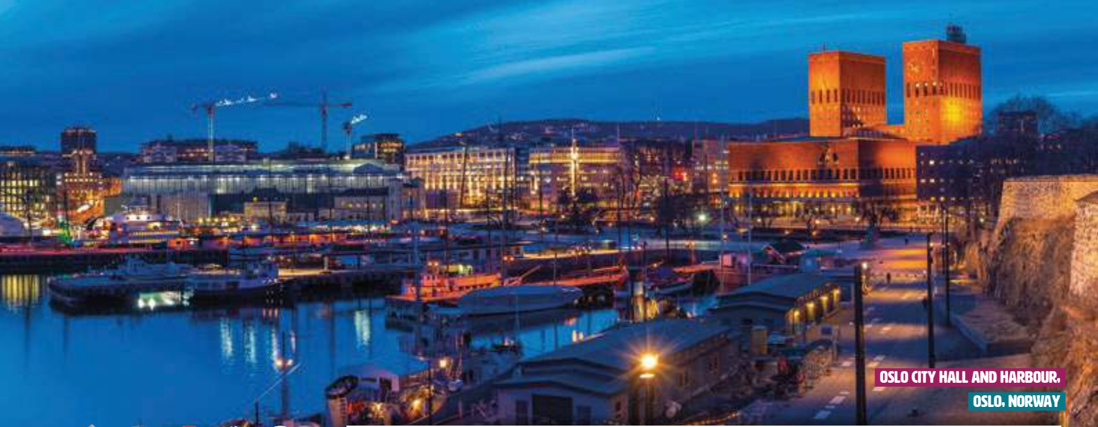
OSLO CITY HALL AND HARBOUR, OSLO, NORWAY