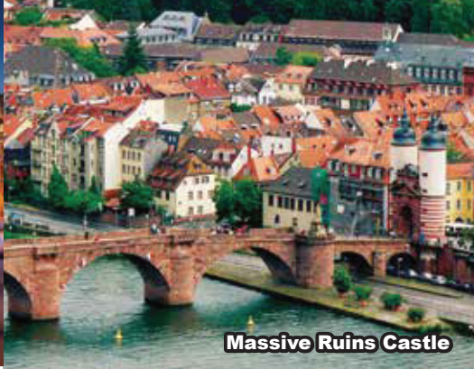
Massive Ruins Castle