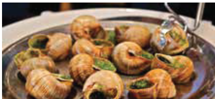
3 Course Meal –French Cuisine with Escargot