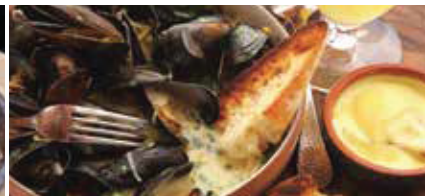
3 Course Meal –Mussels Meals