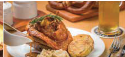
3 Course Meal –German Lunch with Pork Knuckle